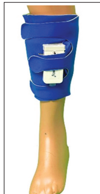
3-Point System Prevents Slipping.