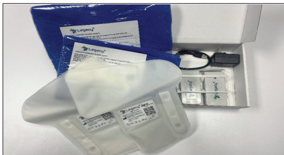
Legacy® maximizes storage. Reusable system reduces costs.