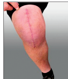
Reduces post-op edema and accelerates healing!

Legacy® IPC is perfect for Veterans undergoing joint replacement surgery to wear throughout hospital stay and during post-surgical recovery while at home until fully ambulatory.