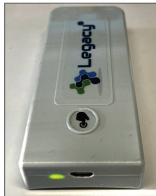
Advanced Pump Technology!